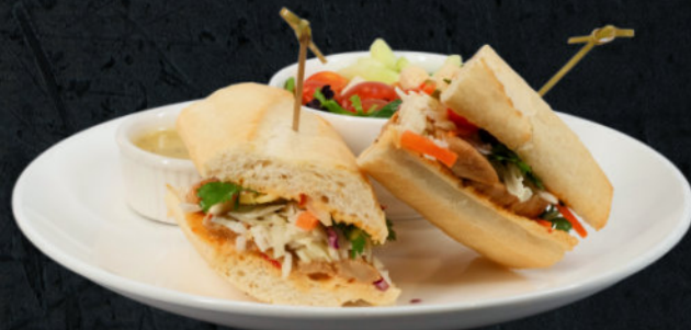
Chicken Banh Mi

Bites offers fresh, vibrant, and satisfying options that are perfect for a quick lunch break or mid-day cravings.