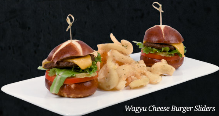
Wagyu Cheese Burger Sliders