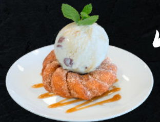
Honey Ruby Rose Dream