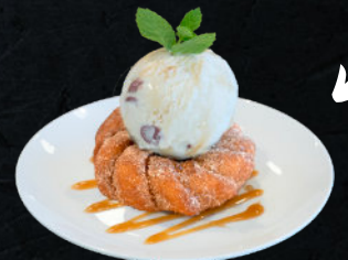
Honey Ruby Rose Dream