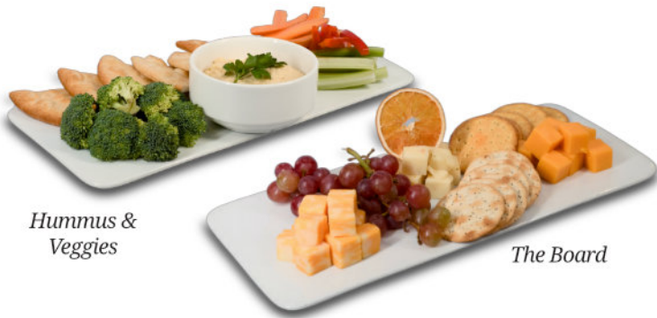
Hummus & Veggies

The perfect start to your meal. Delightful finger foods that are perfect for sharing or savoring on your own.