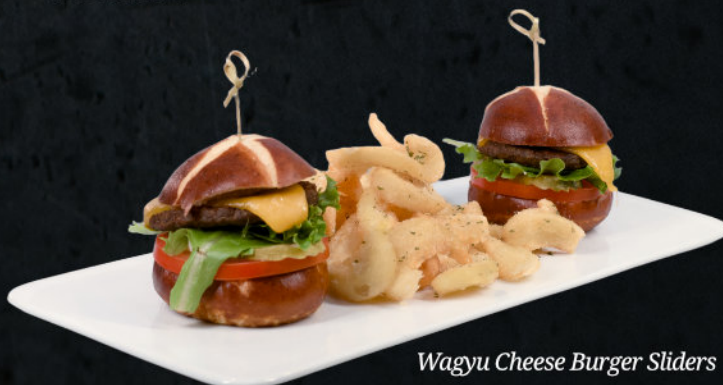
Wagyu Cheese Burger Sliders