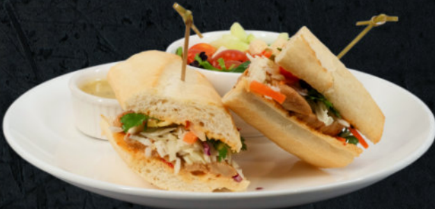
Chicken Banh Mi